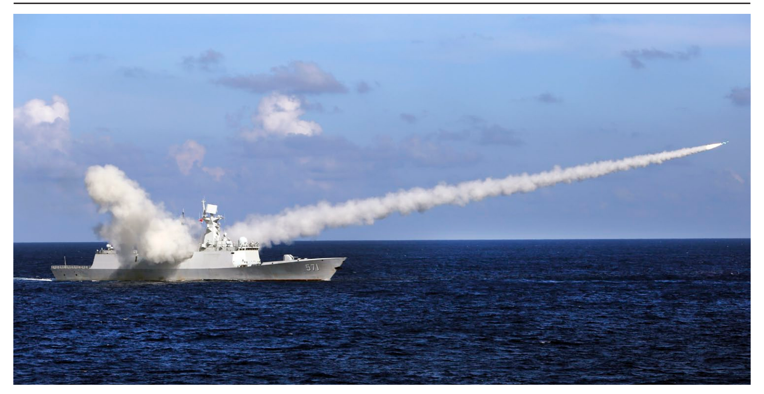
Chinese missile frigate Yuncheng launches an anti-ship missile during a military exercise.

trades' and able to project power globally. Despite the stresses on the UK economy and the defence budget, Britain remains a maritime power, dependent on the sea for trade and food with global interests. Indeed, these global interests, far from shrinking after the draw-down of UK involvement in Afghanistan, seem to be increasing, with the high Arctic, Gulf and Middle East and support of freedom of navigation operations in Asia-Pacific, now joining other tasks for the RN such as defending the Falklands, anti-drug patrols in the Caribbean and the like. The RN, then is already stretched thin, and some ponder how many vessels will need to be assigned to protect HMS Queen Elizabeth , the first time she goes in harm's way - and just how many Type 45 anti-air warfare destroyers might be needed to defend the carrier from a massed missile attack. Unless part of a larger US, NATO or other coalition task force, this may result in the RN having to strip defences elsewhere around the globe to protect this high-value asset.