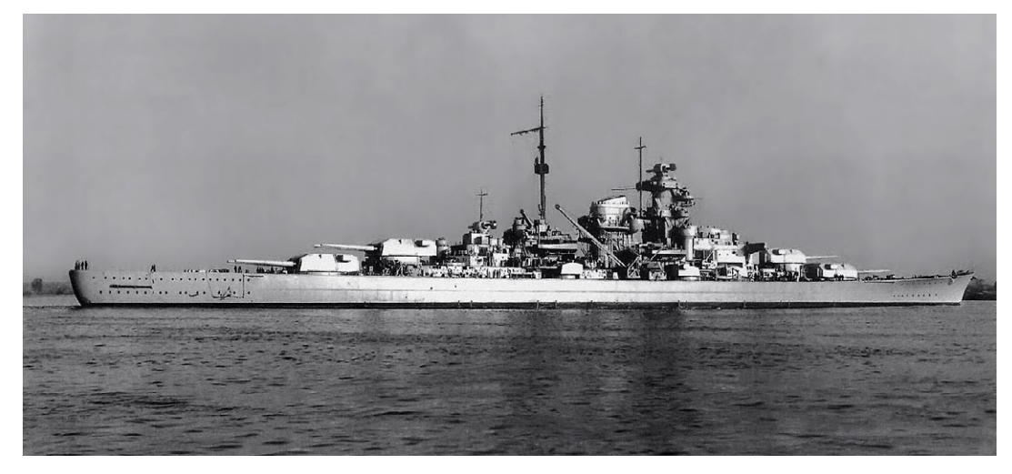
Yamato (top) and Bismark (above) - Have aircraft carriers become obsolete as well?