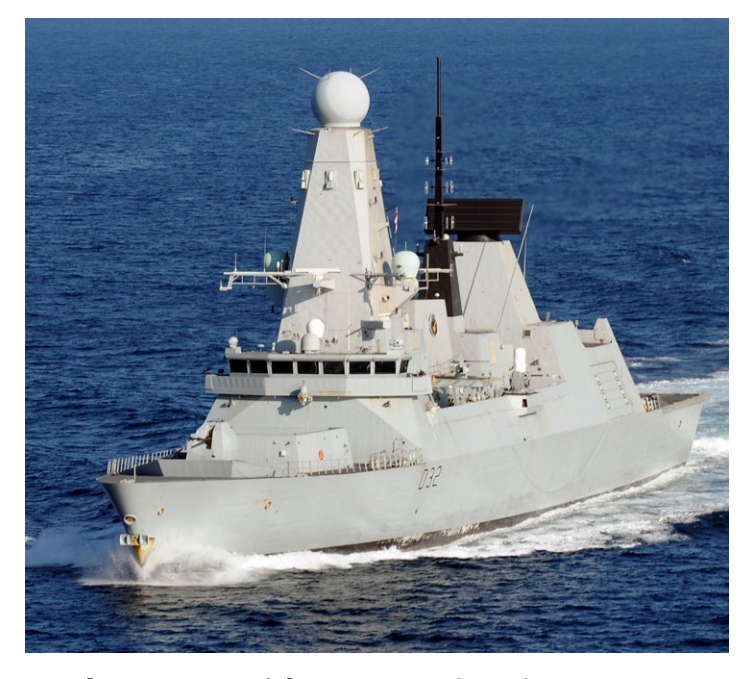
Royal Navy Type 45 destroyer HMS Daring.

its place on the line alongside India's two carriers against Pakistan and its Chinese 'advisors'. Yet this clash of Commonwealth members also presents a stark, yet limited, test for carrier air power vs the new generation of sensors and anti-ship missiles in the 21st century. Will the RN's flagship help give India the edge in this 'come as you are' war, will it be a re-run of the Falklands ('a damned close-run thing') or even worse a humiliating defeat - accelerating the loss of prestige for post-Brexit UK?