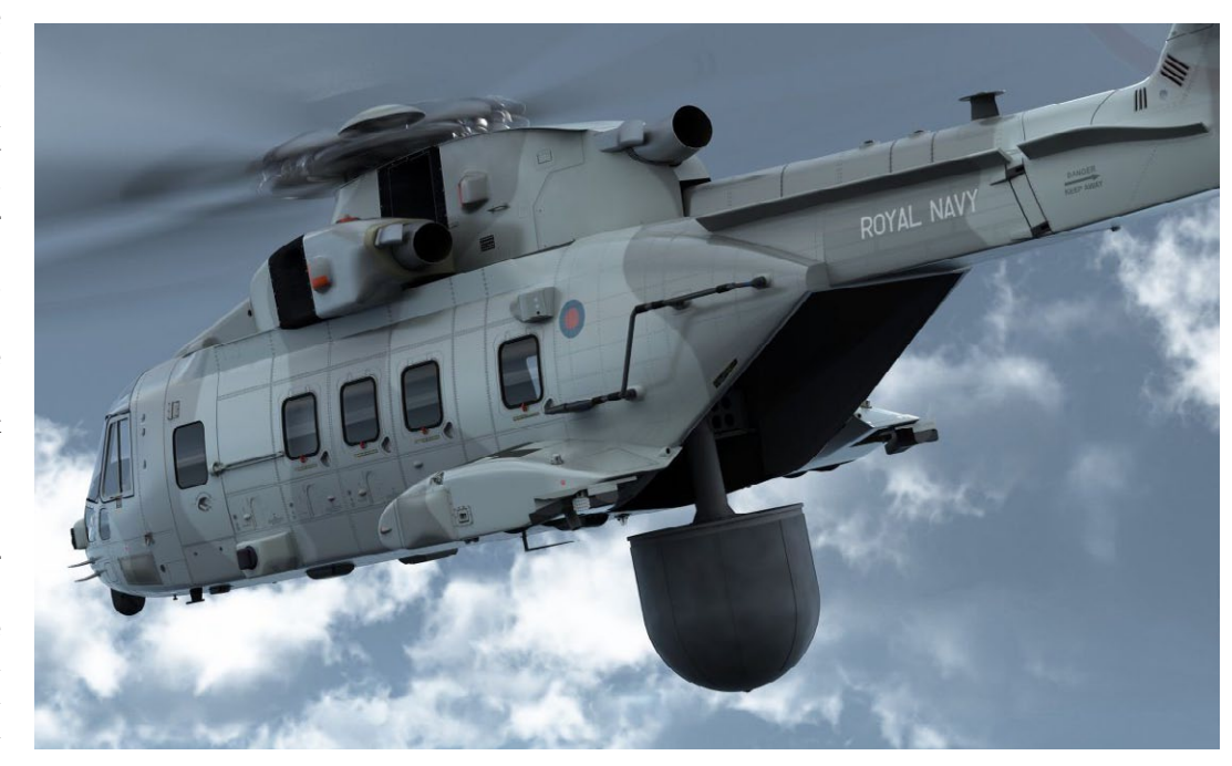
CrowsNest' AEW Merlin Helicopter.

Harrier, it can be operated from sea or land as one mixed RAF/RN force. The VTOL 'B' – thanks to its advanced flight controls also reduces one of the biggest costs to carrier aviation – pilot currency, where the high skills needed for conventional landings mean regular training and additional aircraft for 'nuggets' to learn the ropes. The ease in which land-based Harrier (and now F-35B) pilots can adapt to shipborne operations thus